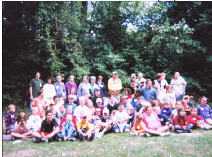
Second annual KIAC Junior Nature Camp another grand success!

Be there! It truly is another feather in Kelleys Island's hat!