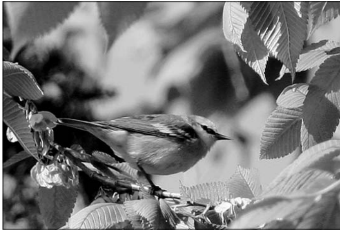
Brewster's Warbler